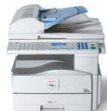
Ricoh MP 161SPF Copier

Phase 1 of our office equipment project is completed and we recently purchased the new computer we needed for our office. Now we are in the final stages of phase 2 - a new copier/printer/fax. God was good and we saw over $600 donated at our ministry conferences. Now we are less than $500 away. Please prayerfully consider how you may help us finish off this project.