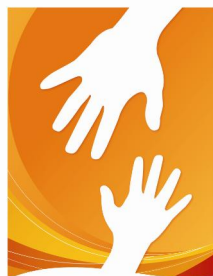
Generation After Generation Awana® Ministry Conference 2010